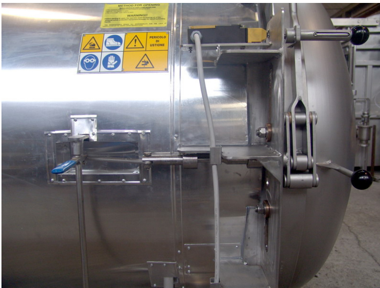
Safety locking system

The machine is made in stainless steel and produces indirect steam to avoid yellowing, fading effect on yarn. Indirect steam gives the possibility to work with waxed cotton yarn. Water sealed vacuum pump. Machine works at low temperature with vacuum system. Heated ceiling to avoid water drops on material. Safety valve tested according CE PED regulation. Hermetical locking system with double switch control. Pneumatic locking of the lid. Full automation control panel with microprocessor. Pressure control by prosestat with contact made by Danfoss. Vacuum control by analogue vacuum meter with contact made by Pakkens. Heating system with electric resistance installed beneath the trolleys.